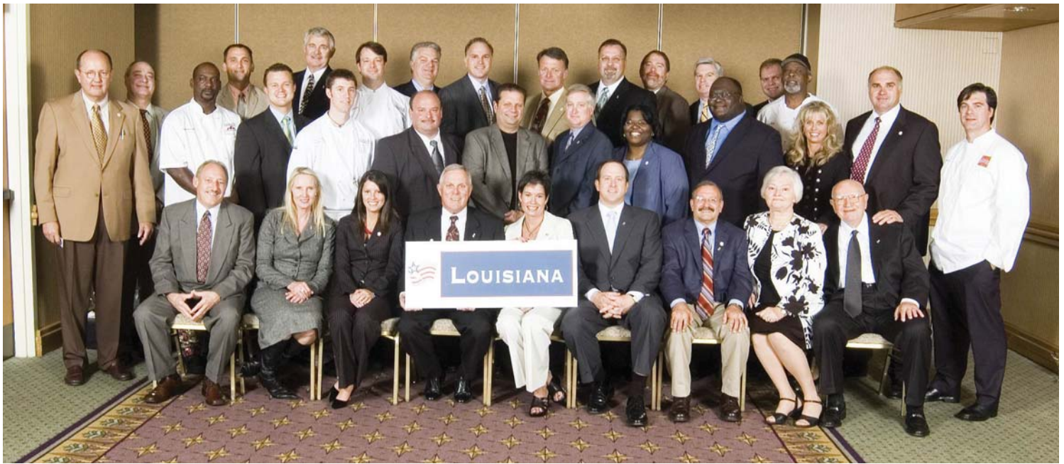
Members of the Louisiana Restaurant Association at the National Restaurant Association Public Affairs Conference.