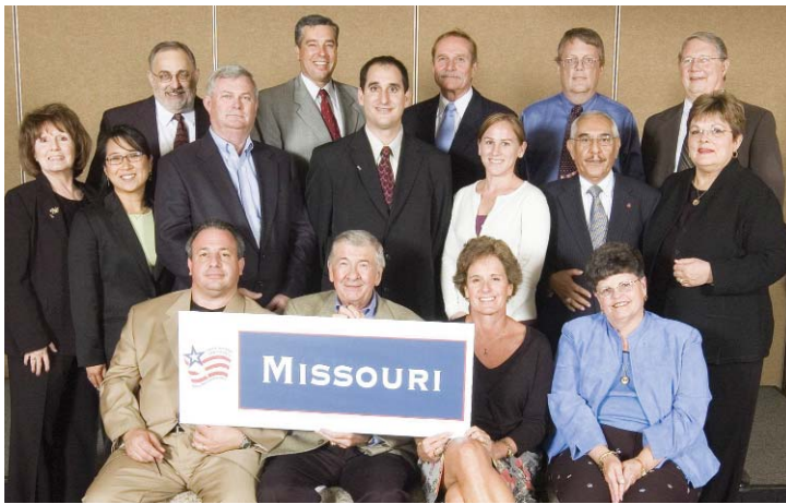
Members of the Missouri Restaurant Association at the National Restaurant Association Public Affairs Conference.