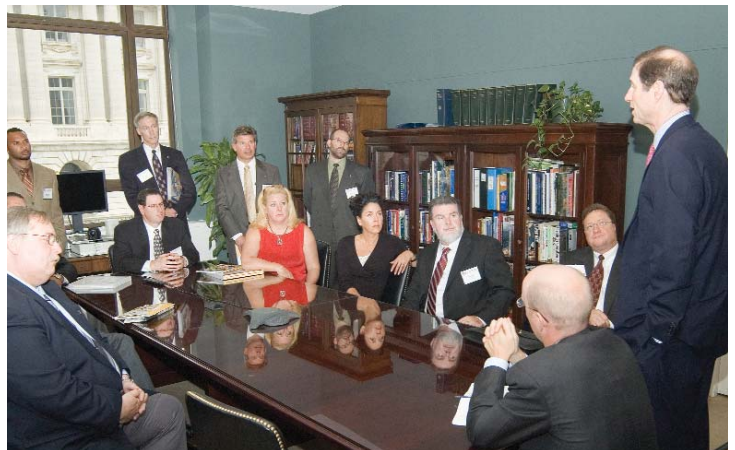
Members of the Oregon Restaurant Association discuss issues with Sen. Ron Wyden (D-Ore.) at the National Restaurant Association Public Affairs Conference.

VALUE: + Voted with us - Voted against us P Voted present S Speaker did not vote NV Did not vote I Not in office