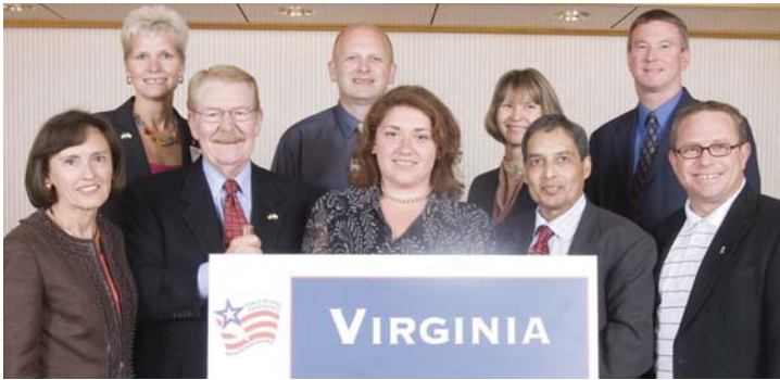
Members of the Virginia Hospitality and Travel Association at the National Restaurant Association Public Affairs Conference.