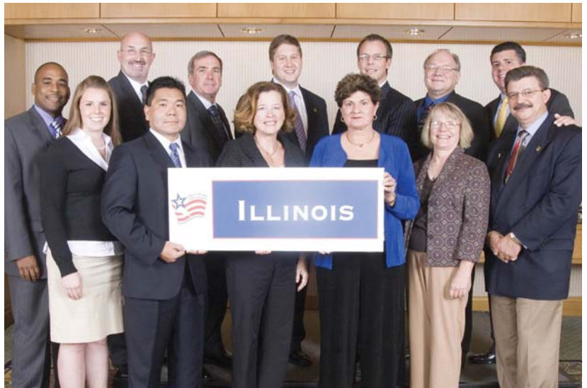
Members of the Illinois Restaurant Association at the National Restaurant Association Public Affairs Conference.

VALUE: + Voted with us - Voted against us P Voted present S Speaker did not vote NV Did not vote I Not in office